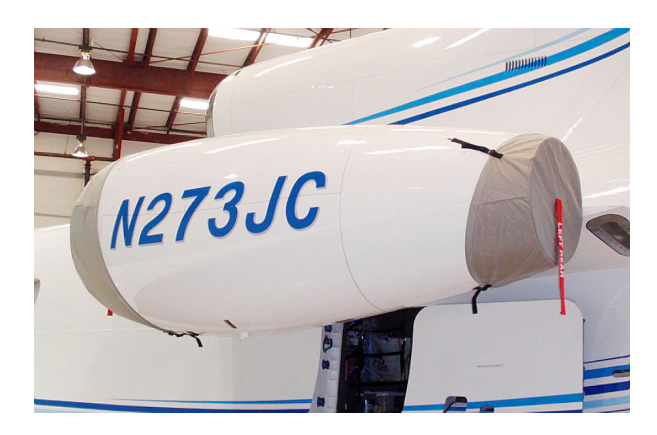
Falcon 7X Outboard Engine Covers