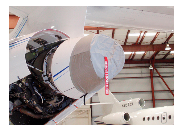
Falcon 7X Center Exhaust Cover

The Falcon Jet 7X Intake Covers are designed to install easily yet be completely storable. A spring steel hoop is sewn into the hem of each cover, allowing them to be installed without climbing onto the wing or using a stepladder. To store the covers the spring steel hoop folds like a band-saw blade into three nesting rings. Each cover folds into a compact circular bundle which is stored in the included duffle bag, yet they unfold quickly for use. The Tri-Fold Ring cover is made of medium weight nylon which is available in a variety of colors to match the paint trim. Each cover set comes complete with installation and folding instructions. The aircraft's registration number can be silkscreened onto the cover for an extra charge.