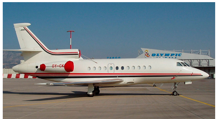
Falcon 900 Engine Covers