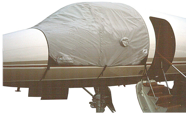
Falcon 50 Windshield Cover

This cover type is made from Silver Acrylic Sunbrella canvas and is 100% lined with a soft and smooth microfiber. Bruce's Custom Covers developed this material combination especially for aircraft protection. The outer material is medium weight and treated for water resistance, UV resistance and anti-static buildup. The inner lining is a very soft and smooth microfiber to prevent scratching. The material is very reflective, and tests show that the cabin interior temperature can be reduced to near-ambient temperature on the hottest of days. It is water, ice and snow repellent, yet breathable to allow moisture to escape from between the cover and the aircraft surface.