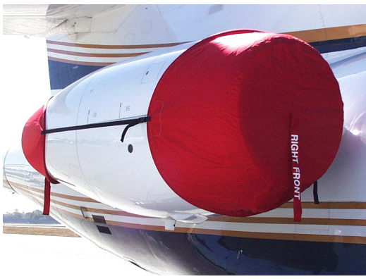
Falcon 50 Outboard Engine Cover