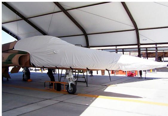
Northup F-5 Talon Canopy/Nose Cover