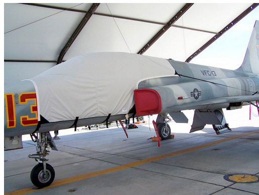
Northup F5 Talon Canopy Cover