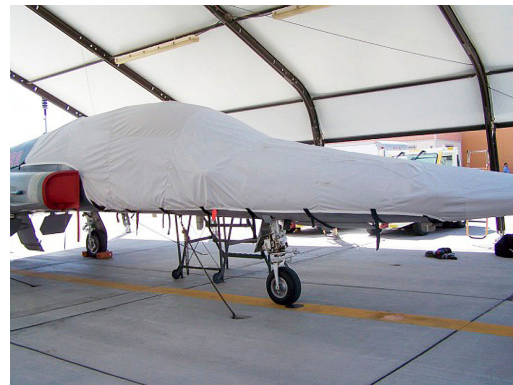
Northup F5 Talon Canopy Cover