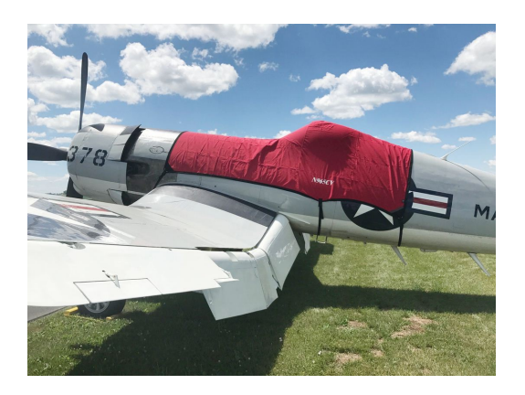
Chance-Vought F4U-7 Canopy Cover