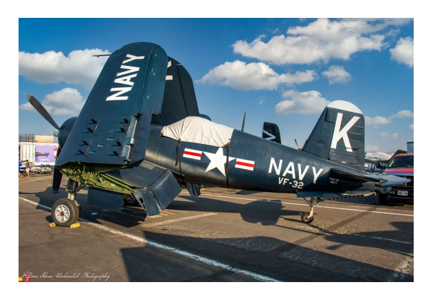
Chance Vought F4U Corsair Canopy Cover