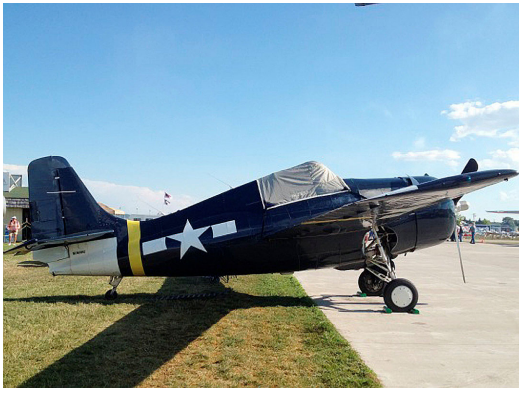
Grumman F4F Wildcat Canopy Cover