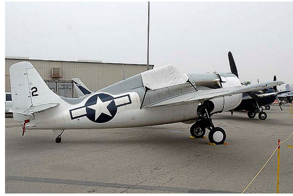
Grumman F4F Wildcat Canopy Cover