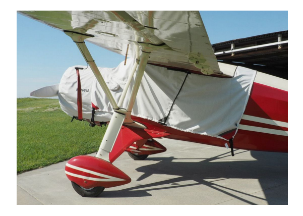
Fairchild 24W Canopy & Engine Cover

This cover type is made from Silver Acrylic Sunbrella canvas and is 100% lined with a soft and smooth microfiber. Bruce's Custom Covers developed this material combination especially for aircraft protection. The outer material is medium weight and treated for water resistance, UV resistance and anti-static buildup. The inner lining is a very soft and smooth microfiber to prevent scratching. The material is very reflective, and tests show that the cabin interior temperature can be reduced to near-ambient temperature on the hottest of days. It is water, ice and snow repellent, yet breathable to allow moisture to escape from between the cover and the aircraft surface.