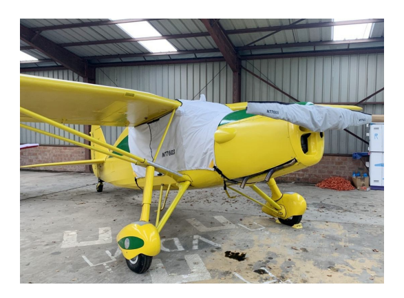
Fairchild 24 Over-Top Canopy Cover