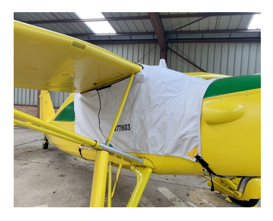
Fairchild 24 Over-Top Canopy Cover

non-travel Sunbrella Cover is the best choice.