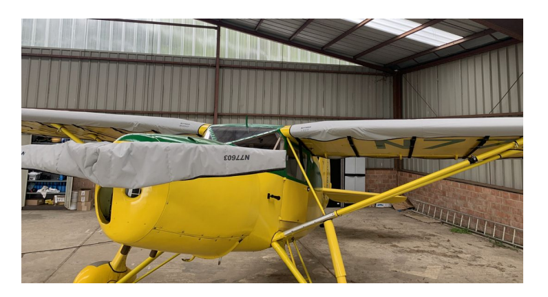
Fairchild 24 Wing & Prop Covers