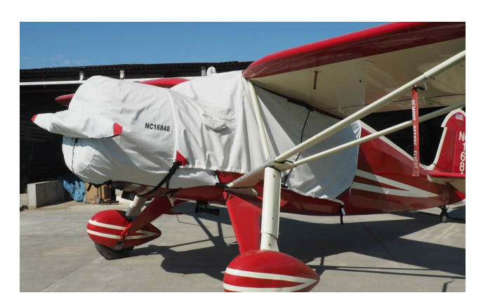
Fairchild 24W Canopy, Engine & Prop Cover