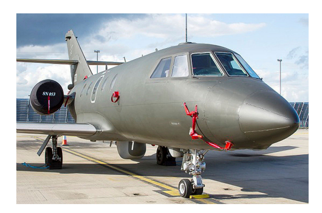
Falcon Engine Covers (not our probe covers)

The Engine Inlet Plugs are custom fit for your Falcon Jet 200 (20H) intakes, made with heavy-duty vinyl material, and stuffed with a single block of sculpted urethane foam. Each plug has a zipper that allows the foam to be removed and dried if necessary. Engine plugs have 'remove before flight' streamers sewn onto the face of the plugs. Most plugs are imprinted with the aircraft registration number in black for an extra charge. Storage bag NOT included. Engine plugs may be inserted after flight when the engine is still warm. Engine Inlet Plugs are commonly referred to as Cowl Plugs, Intake Plugs, Cowl Blocks, Engine Blocks, and Engine Bungs.