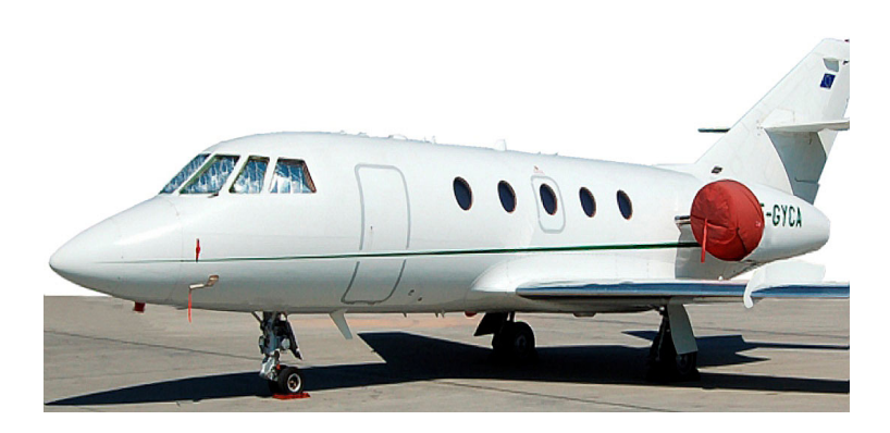
Falcon Engine Cover & Cockpit HeatShields