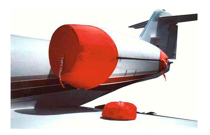
Lear 30 Tri-Fold Engine Cover

The Falcon Jet 200 (20H) Intake Covers are designed to install easily yet be completely storable. A spring steel hoop is sewn into the hem of each cover, allowing them to be installed without climbing onto the wing or using a stepladder. To store the covers the spring steel hoop folds like a band-saw blade into three nesting rings. Each cover folds into a compact circular bundle which is stored in the included duffle bag, yet they unfold quickly for use. The Tri-Fold Ring cover is made of medium weight nylon which is available in a variety of colors to match the paint trim. Each cover set comes complete with installation and folding instructions. The aircraft's registration number can be silkscreened onto the cover for an extra charge.