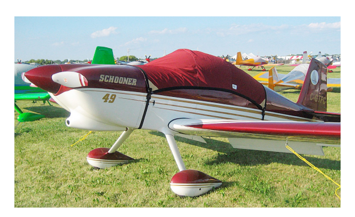
F1 Rocket Canopy Cover