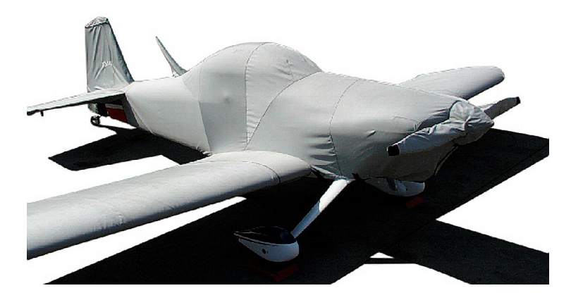
Van's RV-4 Complete Cover

This cover type is made from Silver Acrylic Sunbrella canvas and is 100% lined with a soft and smooth microfiber. Bruce's Custom Covers developed this material combination especially for aircraft protection. The outer material is medium weight and treated for water resistance, UV resistance and anti-static buildup. The inner lining is a very soft and smooth microfiber to prevent scratching. The material is very reflective, and tests show that the cabin interior temperature can be reduced to near-ambient temperature on the hottest of days. It is water, ice and snow repellent, yet breathable to allow moisture to escape from between the cover and the aircraft surface.