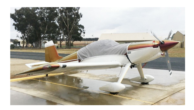
F1 Rocket Travel Cover, Light Weight Travel Canopy Cover, Bubble Windshield, Engine Plugs