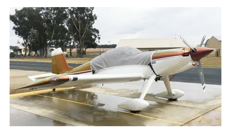
F1 Rocket Travel Cover, Light Weight Travel Canopy Cover, Bubble Windshield, Engine Plugs