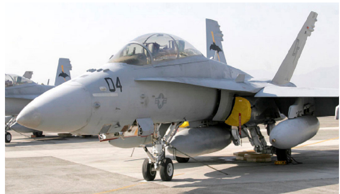
F-18 Intake Cover Set