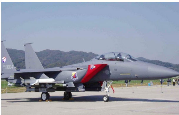
McDonnell Douglas F-15 Eagle Engine Inlet Covers

The McDonnell Douglas F-15 Eagle Intake Covers are designed to install easily yet be completely storable. A spring steel hoop is sewn into the hem of each cover, allowing them to be installed without climbing onto the wing or using a stepladder. To store the covers the spring steel hoop folds like a band-saw blade into three nesting rings. Each cover folds into a compact circular bundle which is stored in the included duffle bag, yet they unfold quickly for use. The Tri-Fold Ring cover is made of medium weight nylon which is available in a variety of colors to match the paint trim. Each cover set comes complete with installation and folding instructions. The aircraft's registration number can be silkscreened onto the cover for an extra charge.