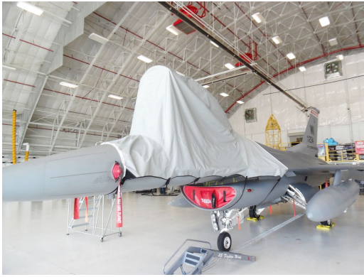
F-16 CANOPY COVER, OPEN POSITION (C-Model, single seat models)

Canopy Covers are commonly referred to as Cabin Covers, Fuselage Covers, Canvas Covers, Canopy Caps, etc.