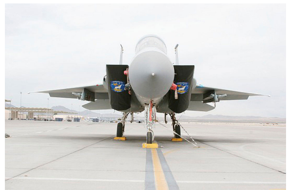
McDonnell-Douglas F-15 Intake Covers