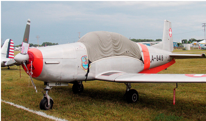
Piaggio P-149D Trainer Canopy Cover

of the Canopy Cover and Engine Cover. This cover will enclose the engine cowl and will extend aft to cover all of the windows. This cover type is made from Silver Acrylic Sunbrella canvas and is 100% lined with a soft and smooth microfiber. Bruce's Custom Covers developed this material combination especially for aircraft protection. The outer material is medium weight and treated for water resistance, UV resistance and anti-static buildup. The inner lining is a very soft and smooth microfiber to prevent scratching. The material is very reflective, and tests show that the cabin interior temperature can be reduced to near-ambient temperature on the hottest of days. It is water, ice and snow repellent, yet breathable to allow moisture to escape from between the cover and the aircraft surface.