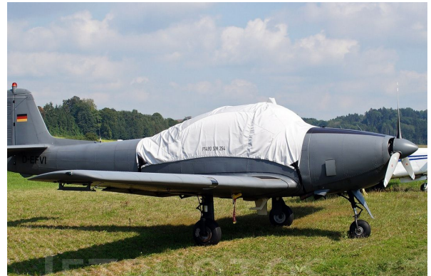
Piaggio P-149 Canopy Cover