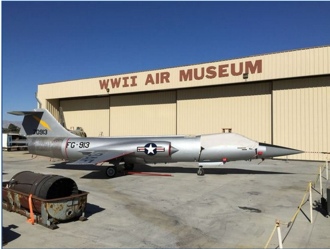
Lockheed F-104 Starfighter Canopy Cover, Single Seat Model