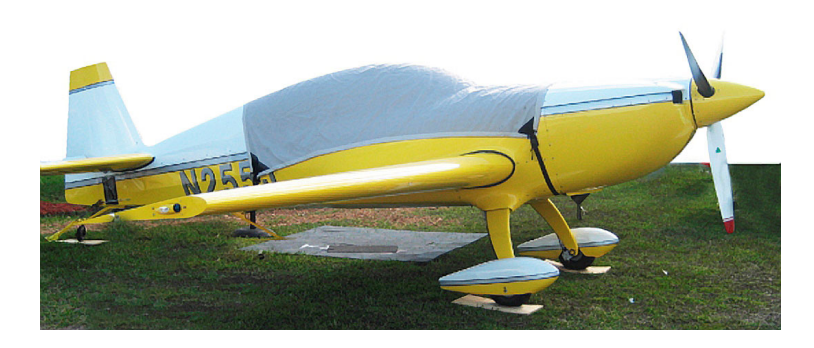
Extra 300L Canopy Cover