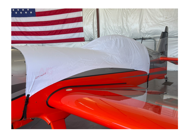
Extra NG Canopy Cover, Single Place Model, test fit cover

This cover type is made from Silver Acrylic Sunbrella canvas and is 100% lined with a soft and smooth microfiber. Bruce's Custom Covers developed this material combination especially for aircraft protection. The outer material is medium weight and treated for water resistance, UV resistance and anti-static buildup. The inner lining is a very soft and smooth microfiber to prevent scratching. The material is very reflective, and tests show that the cabin interior temperature can be reduced to near-ambient temperature on the hottest of days. It is water, ice and snow repellent, yet breathable to allow moisture to escape from between the cover and the aircraft surface.