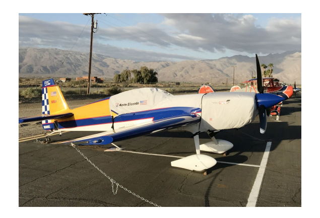
Extra 300S Canopy & Engine Covers