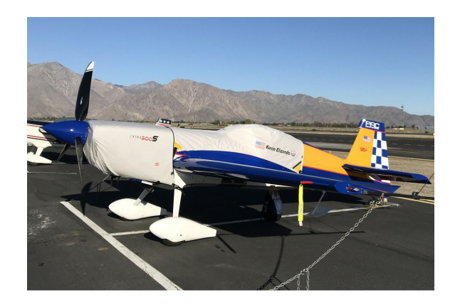
Extra 300S Canopy & Engine Covers

This cover type is made from Silver Acrylic Sunbrella canvas and is 100% lined with a soft and smooth microfiber. Bruce's Custom Covers developed this material combination especially for aircraft protection. The outer material is medium weight and treated for water resistance, UV resistance and anti-static buildup. The inner lining is a very soft and smooth microfiber to prevent scratching. The material is very reflective, and tests show that the cabin interior temperature can be reduced to near-ambient temperature on the hottest of days. It is water, ice and snow repellent, yet breathable to allow moisture to escape from between the cover and the aircraft surface.