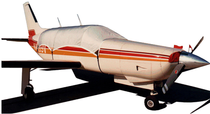
Malibu/Mirage/Meridian Standard Canopy Cover

This cover type is made from Silver Acrylic Sunbrella canvas and is 100% lined with a soft and smooth microfiber. Bruce's Custom Covers developed this material combination especially for aircraft protection. The outer material is medium weight and treated for water resistance, UV resistance and anti-static buildup. The inner lining is a very soft and smooth microfiber to prevent scratching. The material is very reflective, and tests show that the cabin interior temperature can be reduced to near-ambient temperature on the hottest of days. It is water, ice and snow repellent, yet breathable to allow moisture to escape from between the cover and the aircraft surface.