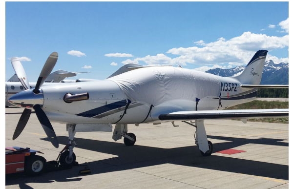
Epic LT Canopy Cover