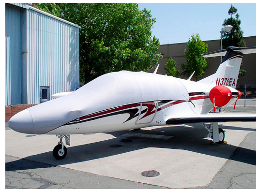
Hangar Dust, Travel Cover & Engine Covers