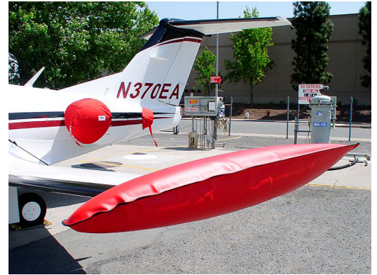
Eclipse Tip Tank & Engine Covers