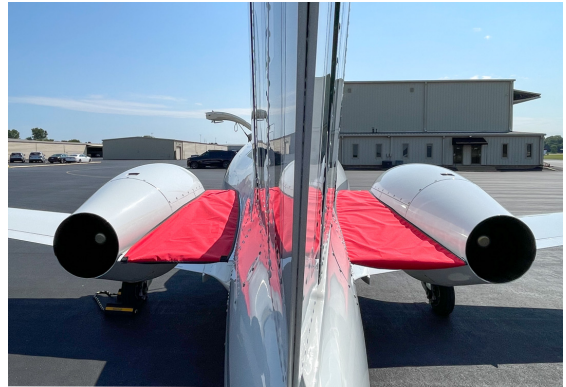
Eclipse EA500, TE500, 550 Pylon Covers