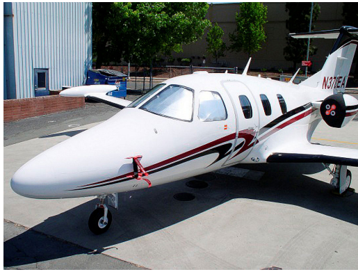
Eclipse Pitot Cover & Bikini Type Engine Covers