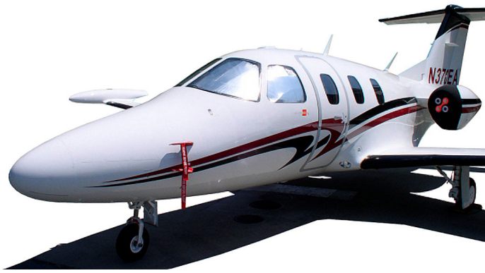
Cockpit HeatShields, Pitot Covers & "Bikini" style Engine Covers