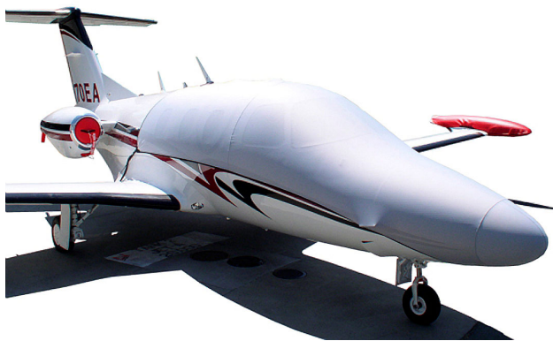
Hangar Dust, Canopy/Nose Cover, Engine Plugs & Tip Tank Pad

This cover type is made from Silver Acrylic Sunbrella canvas and is 100% lined with a soft and smooth microfiber. Bruce's Custom Covers developed this material combination especially for aircraft protection. The outer material is medium weight and treated for water resistance, UV resistance and anti-static buildup. The inner lining is a very soft and smooth microfiber to prevent scratching. The material is very reflective, and tests show that the cabin interior temperature can be reduced to near-ambient temperature on the hottest of days. It is water, ice and snow repellent, yet breathable to allow moisture to escape from between the cover and the aircraft surface.