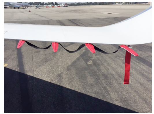
Citation X Static Wick Protectors