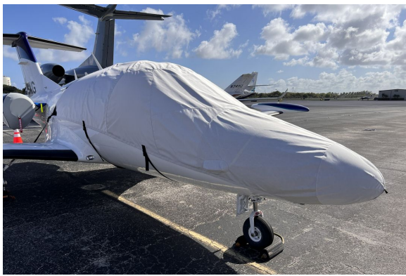
Eclipse EA500 Canopy/Nose Cover

This cover type is made from Silver Acrylic Sunbrella canvas and is 100% lined with a soft and smooth microfiber. Bruce's Custom Covers developed this material combination especially for aircraft protection. The outer material is medium weight and treated for water resistance, UV resistance and anti-static buildup. The inner lining is a very soft and smooth microfiber to prevent scratching. The material is very reflective, and tests show that the cabin interior temperature can be reduced to near-ambient temperature on the hottest of days. It is water, ice and snow repellent, yet breathable to allow moisture to escape from between the cover and the aircraft surface.