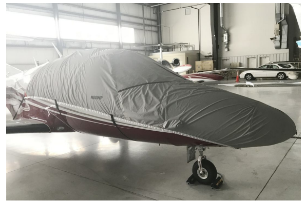
Eclipse EA550 Travel Canopy/Nose Cover