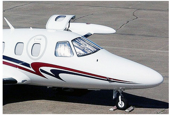
Eclipse Cockpit Heatshields