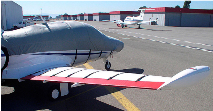
Fuselage Cover with Hail Protection & Wing Control Surfaces Hail Protection Pads

Designed to prevent damage to the aircraft extremities in crowded hangars, these products are made of bright red Naugahyde and thickly padded with a sandwich of closed cell foam.