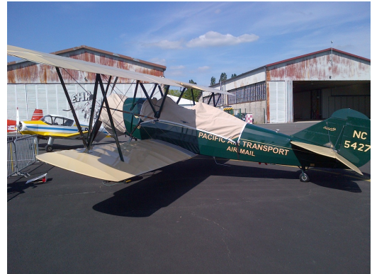
Travelair 4000 Canopy and Engine Cover