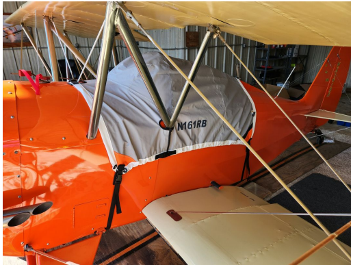
Burt Special Canopy Cover

This cover type is made from Silver Acrylic Sunbrella canvas and is 100% lined with a soft and smooth microfiber. Bruce's Custom Covers developed this material combination especially for aircraft protection. The outer material is medium weight and treated for water resistance, UV resistance and anti-static buildup. The inner lining is a very soft and smooth microfiber to prevent scratching. The material is very reflective, and tests show that the cabin interior temperature can be reduced to near-ambient temperature on the hottest of days. It is water, ice and snow repellent, yet breathable to allow moisture to escape from between the cover and the aircraft surface.