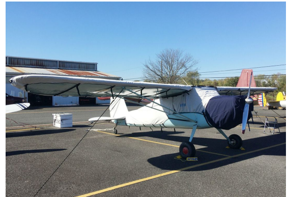
Cessna 140 Insulated Engine, Canopy, Empennage & Wing Covers