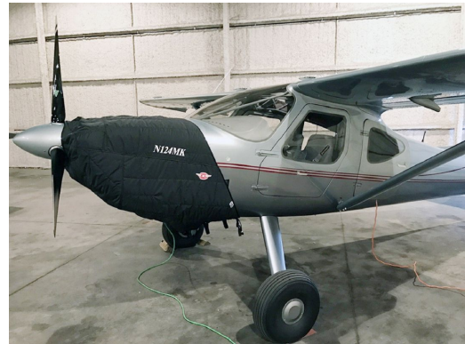
Glaser Aviation Glastar, Sportsman 2+2 Insulated Engine Cover Glaser Aviation Glastar, Sportsman 2+2 Insulated Engine Cover