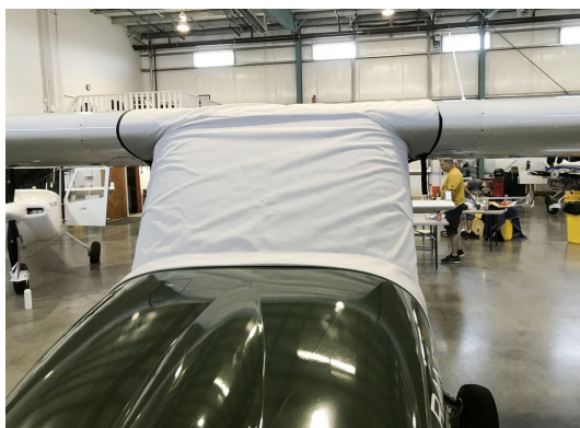
Vashon Ranger R7 Canopy Cover

This cover type is made from Silver Acrylic Sunbrella canvas and is 100% lined with a soft and smooth microfiber. Bruce's Custom Covers developed this material combination especially for aircraft protection. The outer material is medium weight and treated for water resistance, UV resistance and anti-static buildup. The inner lining is a very soft and smooth microfiber to prevent scratching. The material is very reflective, and tests show that the cabin interior temperature can be reduced to near-ambient temperature on the hottest of days. It is water, ice and snow repellent, yet breathable to allow moisture to escape from between the cover and the aircraft surface.