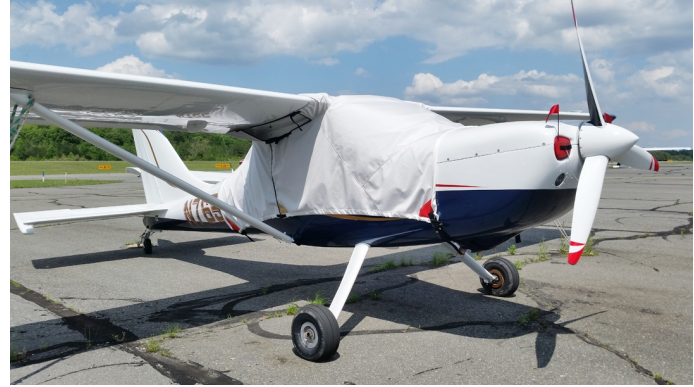
Glastar Over-Top Canopy Cover, Engine Plugs