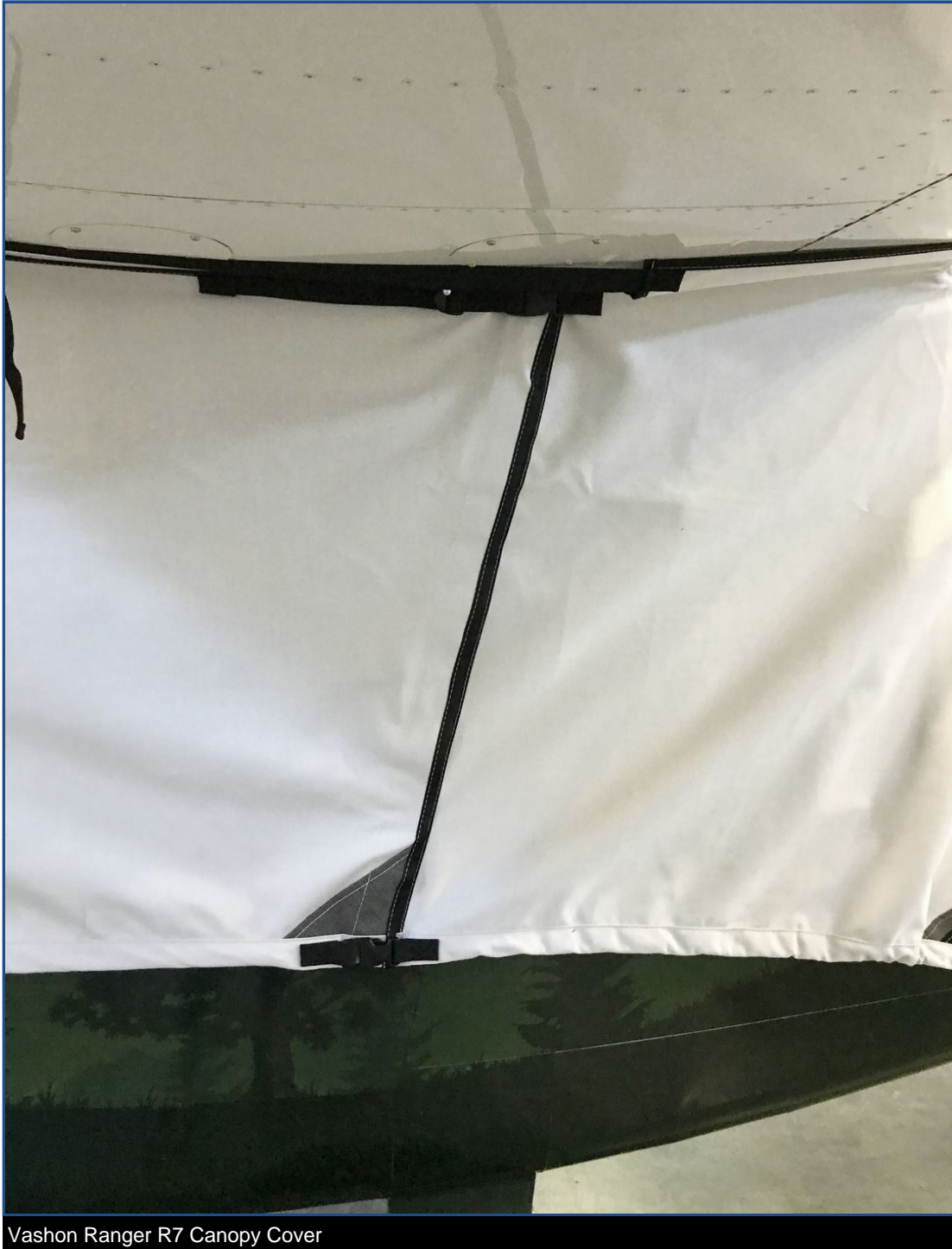
Vashon Ranger R7 Canopy Cover