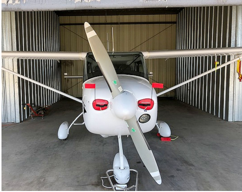
2006 OMF Symphony SA160

plugs have warning flags that are visible from the cockpit or 'remove before flight' streamers sewn onto the face of the plugs. Most plugs are imprinted with the aircraft registration number in black for an extra charge. Storage bag NOT included. Engine plugs may be inserted after flight when the engine is still warm. Engine Inlet Plugs are commonly referred to as Cowl Plugs, Intake Plugs, Cowl Blocks, Engine Blocks, and Engine Bungs.