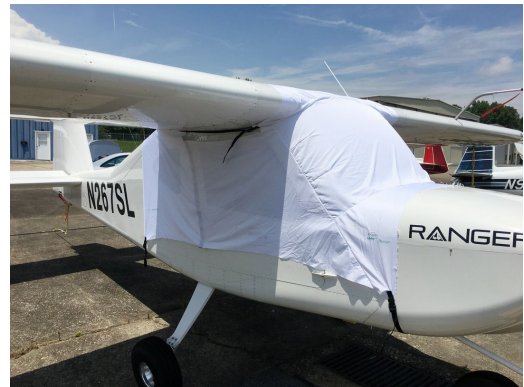
Vashon Ranger VR-7 Canopy Cover, test fit cover