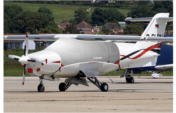
ENGINE PLUGS PREVENT BIRD NEST FOD. Piper Saratoga Engine Cowling Covers, Plugs & HeatShields for the Extra 400 Bird's Nest