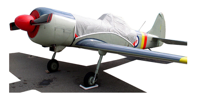
Yak 50 Canopy Cover