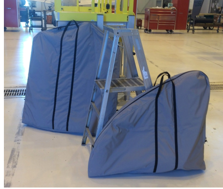
Eurocopter EC-145 Padded Bags for Removable Doors