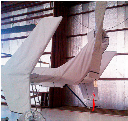
Tail Rotor Cover & Tailboom, Vertical Pylon & Stabilizers Cover

The Engine Inlet Plugs are custom fit for your Eurocopter EC-145, UH-145, BK-117 D-2 intakes, made with heavy-duty vinyl material, and stuffed with a single block of sculpted urethane foam. Each plug has a zipper that allows the foam to be removed and dried if necessary. Engine plugs have 'Remove Before Flight' streamers sewn onto the face of the plugs. Most plugs are imprinted with the aircraft registration number in black for an extra charge. Storage bag NOT included. Engine plugs may be inserted after flight when the engine is still warm. Engine Inlet Plugs are commonly referred to as Cowl Plugs, Intake Plugs, Cowl Blocks, Engine Blocks, and Engine Bungs.