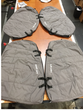
MD 500D Padded Door Bags

**Padded Door Bags* are designed to provide portable protection of the doors when they are removed from the aircraft. They are padded to moderate thickness, zippered closed, and have sturdy carry handles for easy transport.