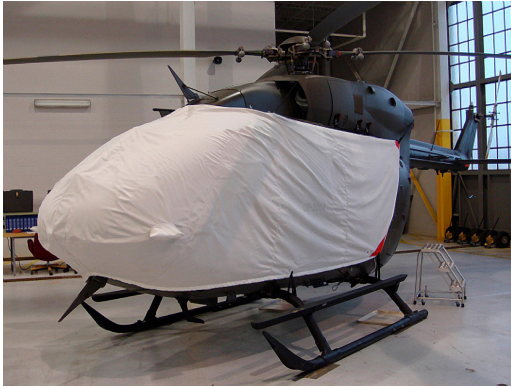
EC-145 Bubble Cover

This cover type is made from Silver Acrylic Sunbrella canvas and is 100% lined with a soft and smooth microfiber. Bruce's Custom Covers developed this material combination especially for aircraft protection. The outer material is medium weight and treated for water resistance, UV resistance and anti-static buildup. The inner lining is a very soft and smooth microfiber to prevent scratching. The material is very reflective, and tests show that the cabin interior temperature can be reduced to near-ambient temperature on the hottest of days. It is water, ice and snow repellent, yet breathable to allow moisture to escape from between the cover and the aircraft surface.