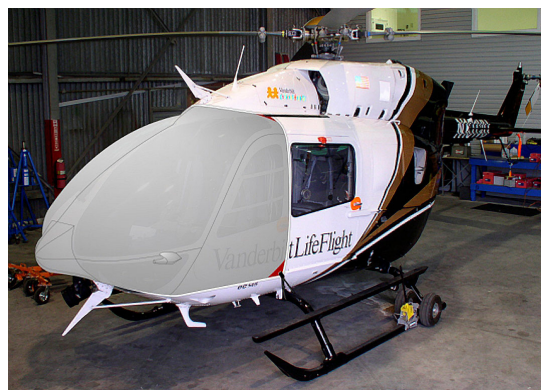
EC-145 Windshield/Nose Cover (illustration)