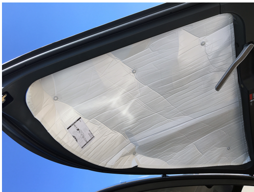
Eurocopter EC-145 Cockpit Heatshields

Heatshields are interior sunshades for an aircraft's windows or canopy glass. The product is a unique composite of closed-cell foam with a silver mylar finish. The semi-rigid design is stiff enough to stand along the inside of the windshield using sun visors or window framing. It folds up flat and easily stores in the included storage sleeve. Some designs may require velcro and suction cups. A Heatshield is an excellent short-term remedy for cockpit overheating.