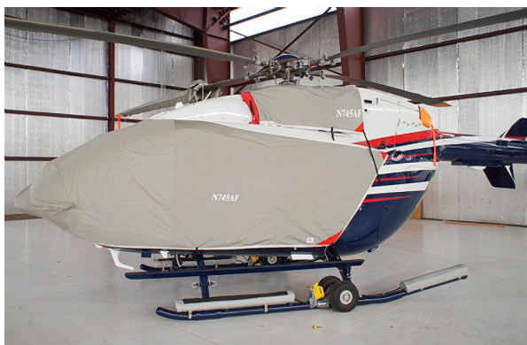
Bubble Cover w/ nose mounted radome, Upper Deck Plugs/Cover