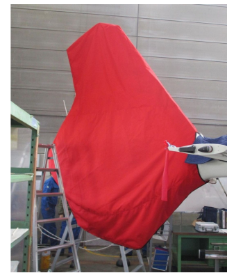
Eurocopter EC-145 D2 Main Body Cover, Tailboom/Fenestron Cover