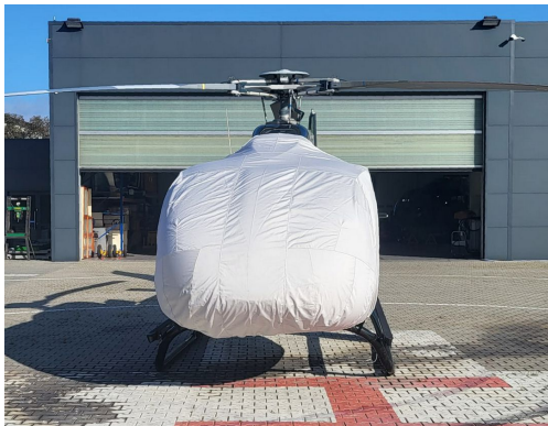
Airbus Helicopter H-130 Bubble Cover, Extends To Cover Fwd Engine Inlet

This cover type is made from Silver Acrylic Sunbrella canvas and is 100% lined with a soft and smooth microfiber. Bruce's Custom Covers developed this material combination especially for aircraft protection. The outer material is medium weight and treated for water resistance, UV resistance and anti-static buildup. The inner lining is a very soft and smooth microfiber to prevent scratching. The material is very reflective, and tests show that the cabin interior temperature can be reduced to near-ambient temperature on the hottest of days. It is water, ice and snow repellent, yet breathable to allow moisture to escape from between the cover and the aircraft surface.