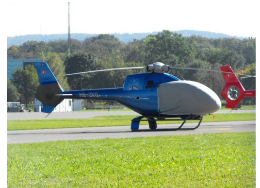
EC-130 Bubble, Tailfan, and Rotor Hub Cover