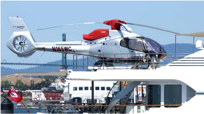
Intake/Exhaust Cover & Rotor Hub Cover (w/ skirt)

tight at the blade root with straps and quick-release plastic buckles. The Cold Weather Blade Covers are fitted with full-length zippers and optional deice "boots" designed to accept a preheater hose; a small opening at the tip of the cover allows for some air circulation and drainage in freezing weather. Some part numbers have features for an extra charge.