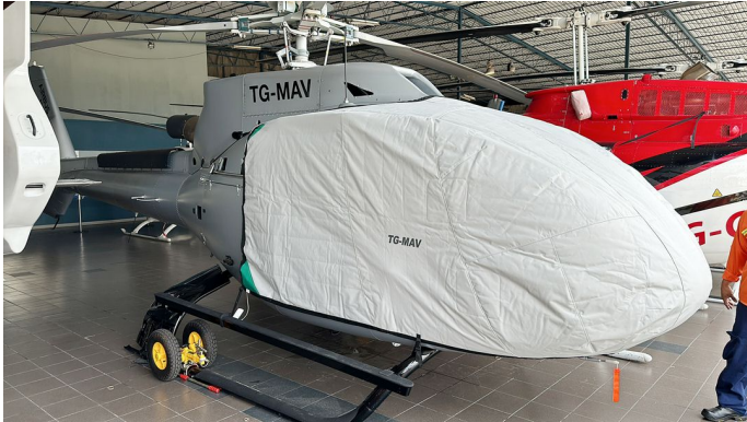
Airbus H-130 Insulated Bubble Cover

This cover type is made from Silver Acrylic Sunbrella canvas and is 100% lined with a soft and smooth microfiber. Bruce's Custom Covers developed this material combination especially for aircraft protection. The outer material is medium weight and treated for water resistance, UV resistance and anti-static buildup. The inner lining is a very soft and smooth microfiber to prevent scratching. The material is very reflective, and tests show that the cabin interior temperature can be reduced to near-ambient temperature on the hottest of days. It is water, ice and snow repellent, yet breathable to allow moisture to escape from between the cover and the aircraft surface.