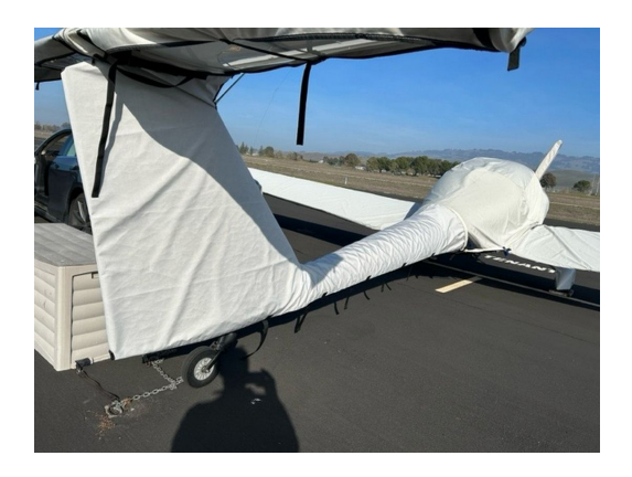
Dimona HK-36 Empennage Cover Set