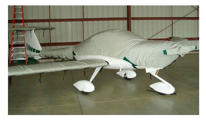
DA-20 Canopy/Engine, Prop/Spinner, Wing, Tailboom, Horiz. Stab. Covers

This cover type is made from Silver Acrylic Sunbrella canvas and is 100% lined with a soft and smooth microfiber. Bruce's Custom Covers developed this material combination especially for aircraft protection. The outer material is medium weight and treated for water resistance, UV resistance and anti-static buildup. The inner lining is a very soft and smooth microfiber to prevent scratching. The material is very reflective, and tests show that the cabin interior temperature can be reduced to near-ambient temperature on the hottest of days. It is water, ice and snow repellent, yet breathable to allow moisture to escape from between the cover and the aircraft surface.