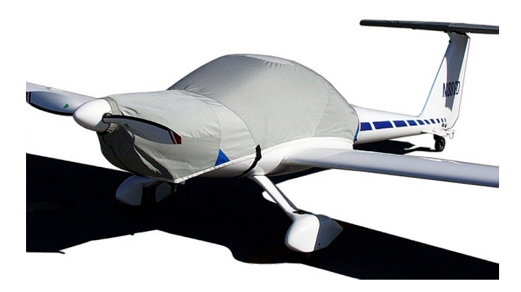
Diamond Super Dimona Cover Set