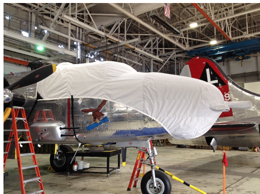
B25 Cockpit/Nose Cover

This cover type is made from Silver Acrylic Sunbrella canvas and is 100% lined with a soft and smooth microfiber. Bruce's Custom Covers developed this material combination especially for aircraft protection. The outer material is medium weight and treated for water resistance, UV resistance and anti-static buildup. The inner lining is a very soft and smooth microfiber to prevent scratching. The material is very reflective, and tests show that the cabin interior temperature can be reduced to near-ambient temperature on the hottest of days. It is water, ice and snow repellent, yet breathable to allow moisture to escape from between the cover and the aircraft surface.