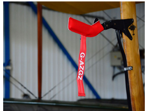
DeHavilland DH-82 Tiger Moth Pitot Cover