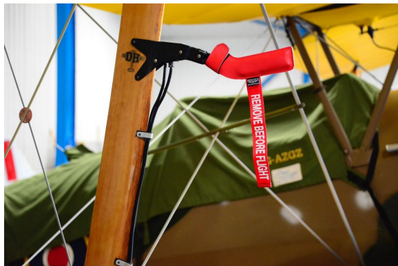
DeHavilland DH-82 Tiger Moth Pitot Cover

DeHavilland DH-82 Tiger Moth Pitot Tube Covers , NOT HEAT RESISTANT TYPE, are made of Naugahyde vinyl, and are designed to cover the entire pitot assembly. Slipping over the tube, the cover tightens around the base with a Velcro strap detail. A "Remove Before Flight" streamer is attached to the cover. Heat Resistant Pitot Covers are an upgrade to this design, and help prevent the pitot cover from melting onto the tube if the pitot heat is accidentally turned on while installed. If you want the set tethered together, please let us know.