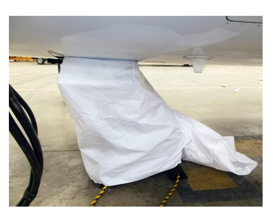
Q400, Nose gear landing/tire covers - Cold Weather Ops

Q400, Main gear landing/tire covers - Cold Weather Ops