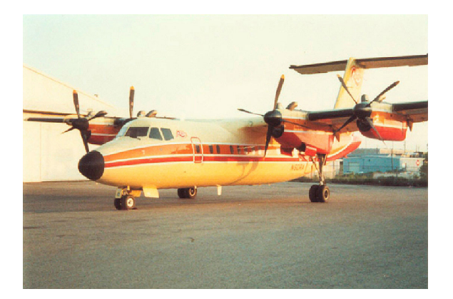
Covers & Plugs for the Dash 7