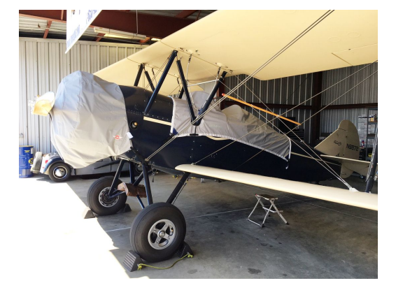
Travel Air 4000 Canopy and Engine Covers, light weight travel Travel Air 4000 Canopy and Engine Covers, light weight travel type