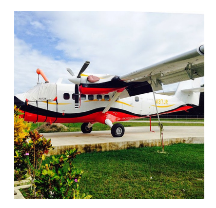
Twin Otter Cockpit Cover & Engine Plugs

water resistance, UV resistance and anti-static buildup. The inner lining is a very soft and smooth microfiber to prevent scratching. The material is very reflective, and tests show that the cabin interior temperature can be reduced to near-ambient temperature on the hottest of days. It is water, ice and snow repellent, yet breathable to allow moisture to escape from between the cover and the aircraft surface.