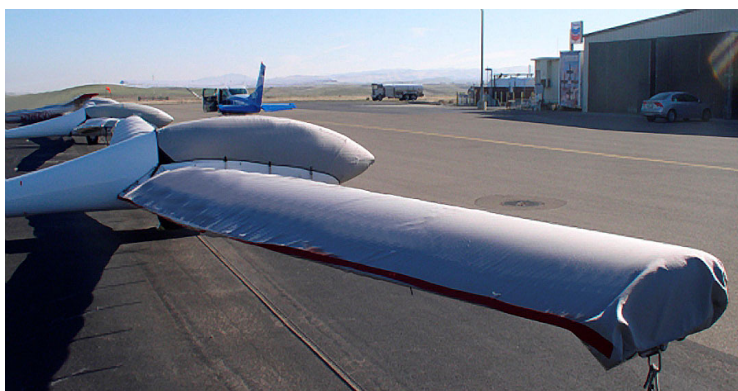
Sailplane Full Cover Set Graphic Indicators (Discus 2B, 3D model)