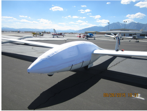
DG-505 Canopy/Nose Cover (test fit cover)