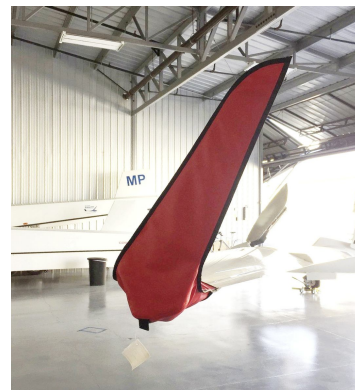
Schleicher ASH Wingtip Pads