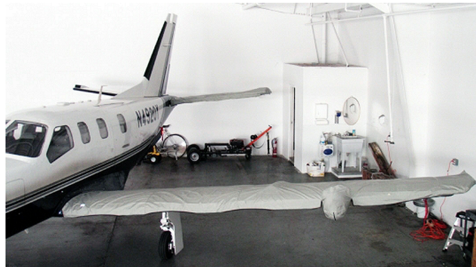
Pilatus PC-12 Wing Covers

WINTER USE MATERIAL - Made with Solution-Dyed Polyester fabric, this option is intended for seasonal use to aid in deicing, rain mitigation, or for occasional travel. The material is lighter and more compact, but more susceptible to UV damage and may have a shorter useful life if used continuously outside than the all-year use material.