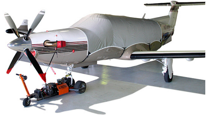
Main Intake Plug and Prop-Tie/Exhaust Covers. (Sold Separately) PC-12 Canopy Cover, Engine Plugs, Prop Tie/Exhaust Covers