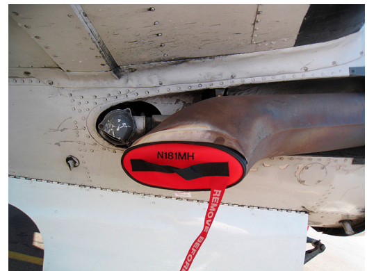
Beech 18 Exhaust Plugs