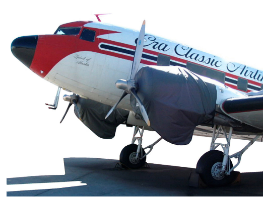
Engine Covers are available in either standard or insulated designs.