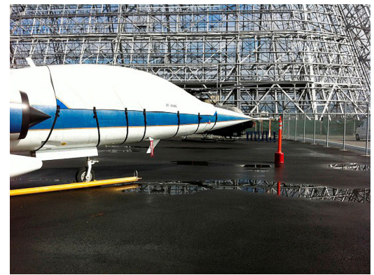
F-104 Tandem Canopy Cover