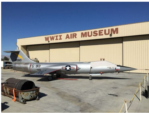
Lockheed F-104 Starfighter Canopy Cover, Single Seat Model