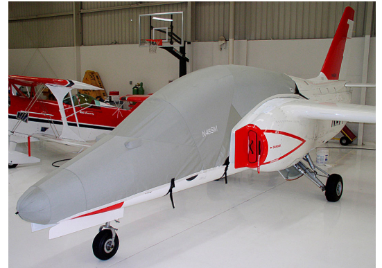
S-21 Canopy/Nose Cover & Engine Plugs