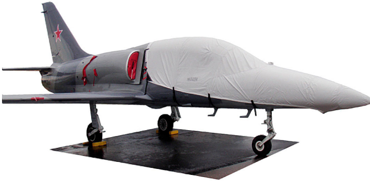
L-39 Canopy/Nose Cover & Plugs

This cover type is made from Silver Acrylic Sunbrella canvas and is 100% lined with a soft and smooth microfiber. Bruce's Custom Covers developed this material combination especially for aircraft protection. The outer material is medium weight and treated for water resistance, UV resistance and anti-static buildup. The inner lining is a very soft and smooth microfiber to prevent scratching. The material is very reflective, and tests show that the cabin interior temperature can be reduced to near-ambient temperature on the hottest of days. It is water, ice and snow repellent, yet breathable to allow moisture to escape from between the cover and the aircraft surface.