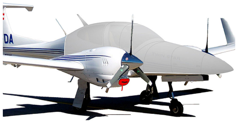
Twinstar Extended Canopy/Nose Cover & Engine Plugs (Illustration)