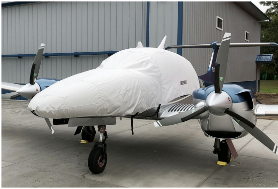
Diamond DA-62 Canopy/Nose Cover