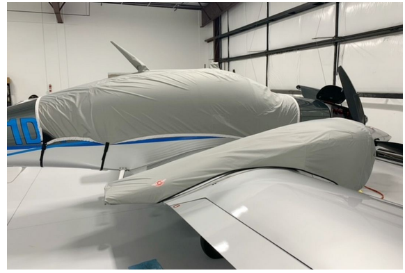
Diamond DA-62 Travel Weight Canopy & Engine Covers