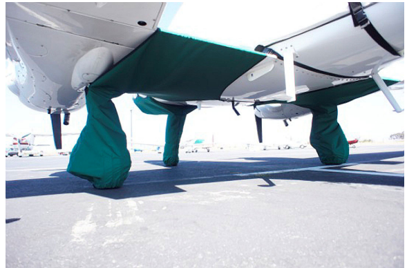
Twinstar Landing Gear & Gearwell Covers