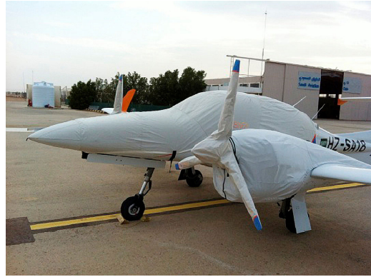
Diamond DA-42NG Canopy/Nose, Engine & Prop Covers