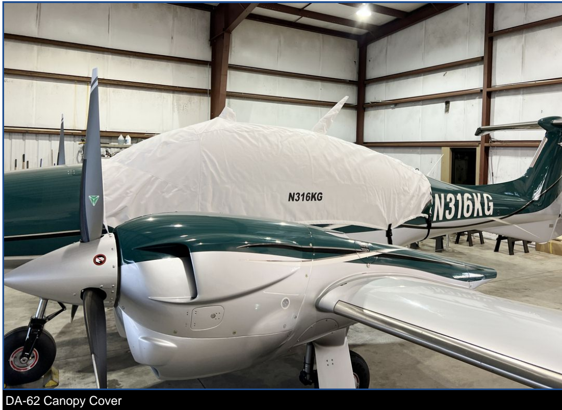
DA-62 Canopy Cover