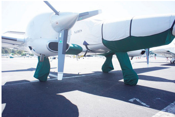
Twinstar Landing Gear & Gearwell Covers