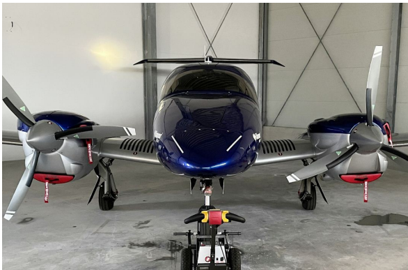
DA-62 engine inlet plugs

Engine Inlet Plugs are custom fit for your Diamond DA-62 intakes, made with heavy-duty vinyl material, and stuffed with a single block of sculpted urethane foam. Each plug has a zipper that allows the foam to be removed and dried if necessary. Engine plugs have warning flags that are visible from the cockpit or 'remove before flight' streamers sewn onto the face of the plugs. Most plugs are imprinted with the aircraft registration number in black for an extra charge. Storage bag NOT included. Engine plugs may be inserted after flight when the engine is still warm. Engine Inlet Plugs are commonly referred to as Cowl Plugs, Intake Plugs, Cowl Blocks, Engine Blocks, and Engine Bungs.