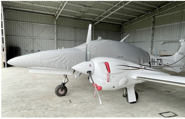
Diamond DA-62 Canopy/Nose Cover, Engine Plugs