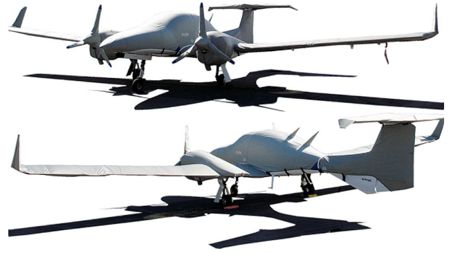
DA-42 Full Cover Set: Extended Canopy/Nose, Wing/Engine, Prop, Empennage