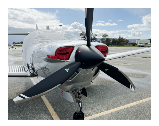
Diamond DA-50 Engine Plugs

Engine Inlet Plugs are custom fit for your Diamond DA-50 Superstar intakes, made with heavy-duty vinyl material, and stuffed with a single block of sculpted urethane foam. Each plug has a zipper that allows the foam to be removed and dried if necessary. Engine plugs have warning flags that are visible from the cockpit or 'remove before flight' streamers sewn onto the face of the plugs. Most plugs are imprinted with the aircraft registration number in black for an extra charge. Storage bag NOT included. Engine plugs may be inserted after flight when the engine is still warm. Engine Inlet Plugs are commonly referred to as Cowl Plugs, Intake Plugs, Cowl Blocks, Engine Blocks, and Engine Bungs.