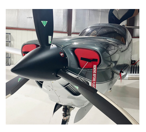
Diamond DA-50 Superstar Engine Inlet Plugs