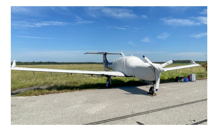
Diamond DA-50 Extended Canopy/Engine Cover, Wing & Prop Covers