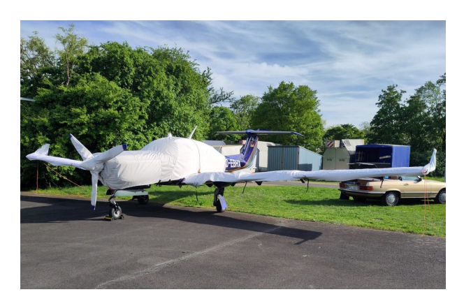
Diamond DA-50 Extended Canopy/Engine Cover, Wing & Prop Diamond DA-50 Extended Canopy/Engine, Prop & Wing Covers (test fit)