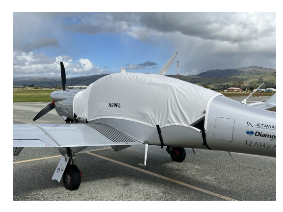
Diamond DA-50 Canopy Cover

This cover type is made from Silver Acrylic Sunbrella canvas and is 100% lined with a soft and smooth microfiber. Bruce's Custom Covers developed this material combination especially for aircraft protection. The outer material is medium weight and treated for water resistance, UV resistance and anti-static buildup. The inner lining is a very soft and smooth microfiber to prevent scratching. The material is very reflective, and tests show that the cabin interior temperature can be reduced to near-ambient temperature on the hottest of days. It is water, ice and snow repellent, yet breathable to allow moisture to escape from between the cover and the aircraft surface.