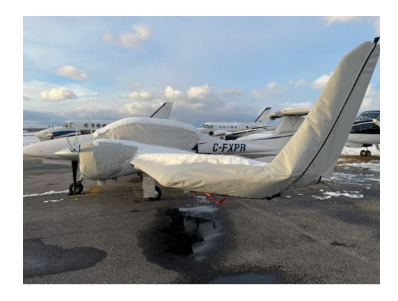
Diamond DA-42 Canopy, Wing, Engine & Horizontal Stabilizer Covers

WINTER USE MATERIAL - Made with Solution-Dyed Polyester fabric, this option is intended for seasonal use to aid in deicing, rain mitigation, or for occasional travel. The material is lighter and more compact, but more susceptible to UV damage and may have a shorter useful life if used continuously outside than the all-year use material.