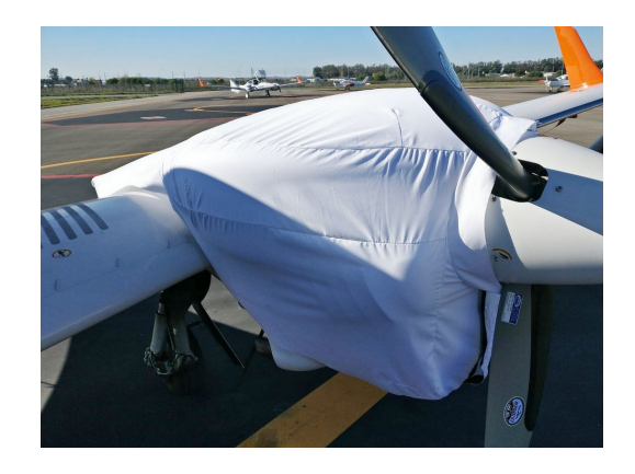
DA42 MPP Guardian (DA42-NG) Engine Cover, test fit cover