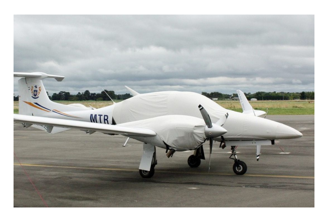
Diamond DA-42 Canopy/Nose & Engine Cover