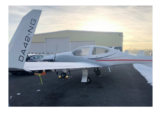
Diamond DA-42 Twinstar Engine Covers