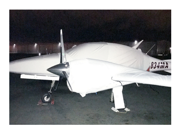
Diamond DA-42 Twin Star Wing & Engine Covers