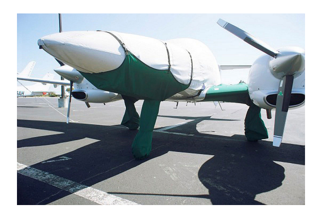
Diamond DA-42 Twinstar Landing Gear & Gearwell Covers