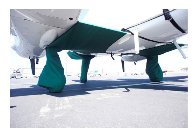
Twinstar Landing Gear & Gearwell Covers