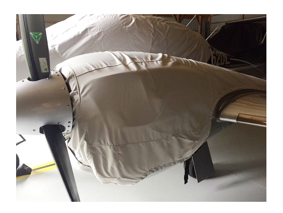
Diamond DA42-VI Canopy/Nose Cover