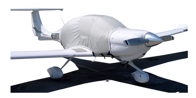
Diamond DA-40 Extended Canopy Cover