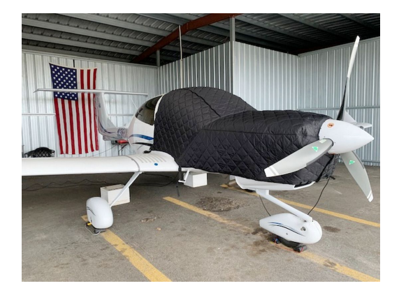
Diamond DA-40 Insulated Cockpit & Engine Cover

This cover type is made from Silver Acrylic Sunbrella canvas and is 100% lined with a soft and smooth microfiber. Bruce's Custom Covers developed this material combination especially for aircraft protection. The outer material is medium weight and treated for water resistance, UV resistance and anti-static buildup. The inner lining is a very soft and smooth microfiber to prevent scratching. The material is very reflective, and tests show that the cabin interior temperature can be reduced to near-ambient temperature on the hottest of days. It is water, ice and snow repellent, yet breathable to allow moisture to escape from between the cover and the aircraft surface.