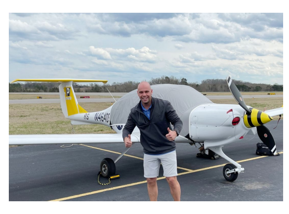
Diamond DA-40 Light Weight Travel Cover

Travel Covers are made with Silver Solution-Dyed Polyester fabric and only lined over the windshield to save weight. The material is lightweight and more compact for easy stowage in the aircraft. The polyester material is water resistant, but only intended for occasional use outside. We also have an ultra lightweight material available for fitted hangar dust covers. For daily outdoor use, the non-travel Sunbrella Cover is the best choice.