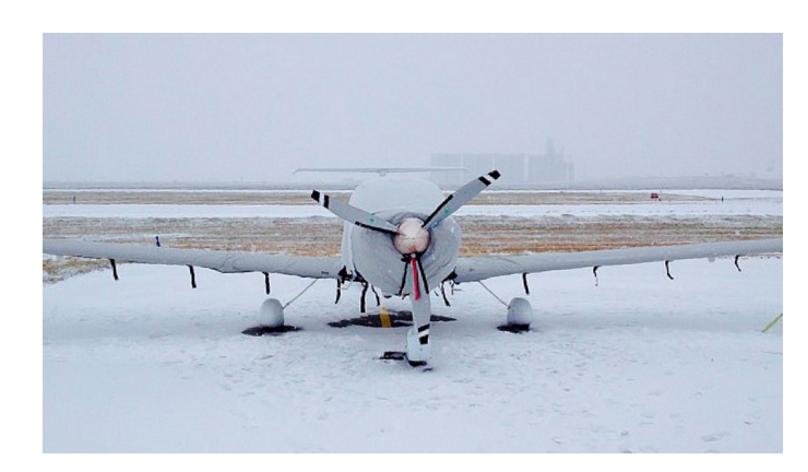
Diamond DA-40 Extended Canopy Cover, Wing Covers & Insulated Engine Cover