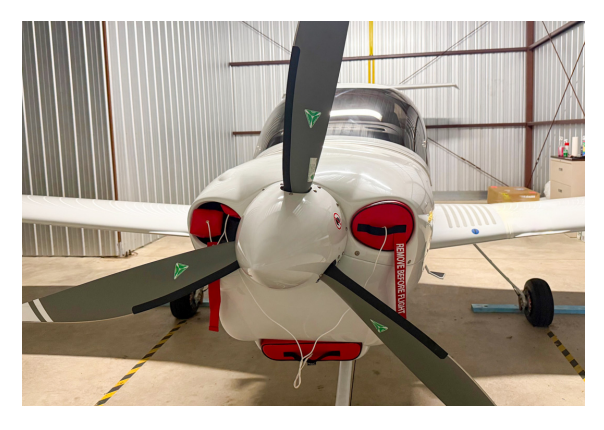
Diamond DA-40 NG Engine Inlet Plugs