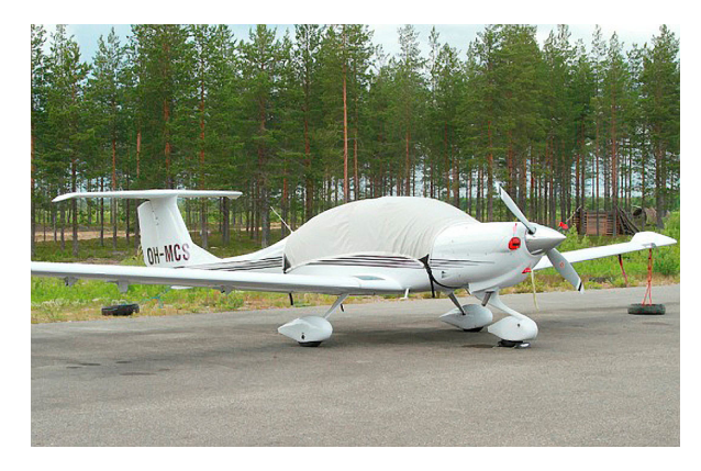
Diamond DA-40 Canopy Cover, Engine Plugs

This cover type is made from Silver Acrylic Sunbrella canvas and is 100% lined with a soft and smooth microfiber. Bruce's Custom Covers developed this material combination especially for aircraft protection. The outer material is medium weight and treated for water resistance, UV resistance and anti-static buildup. The inner lining is a very soft and smooth microfiber to prevent scratching. The material is very reflective, and tests show that the cabin interior temperature can be reduced to near-ambient temperature on the hottest of days. It is water, ice and snow repellent, yet breathable to allow moisture to escape from between the cover and the aircraft surface.