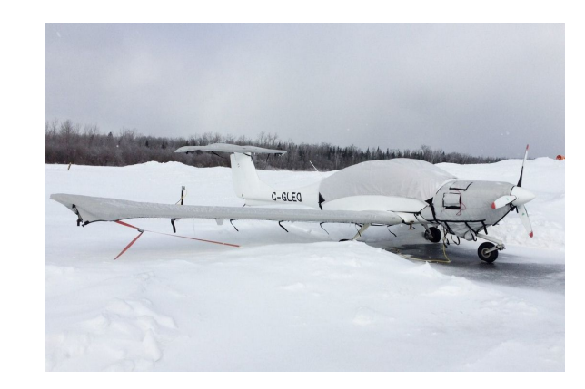
Diamond DA40 Canopy, Insulated Engine, Wing and Stab. Covers