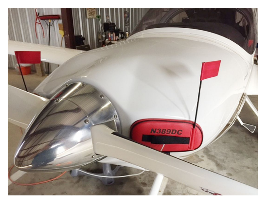
Diamond DA-20-C1 Engine Inlet Plugs