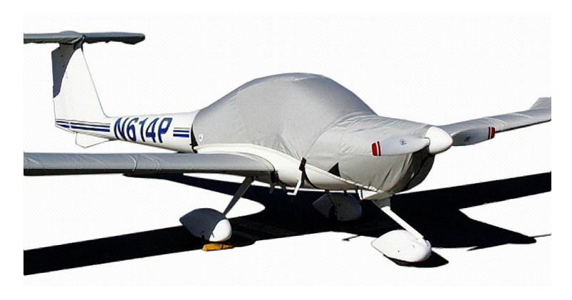
Diamond DA-20 Canopy/Engine, Wing & Horiz. Stab. Covers