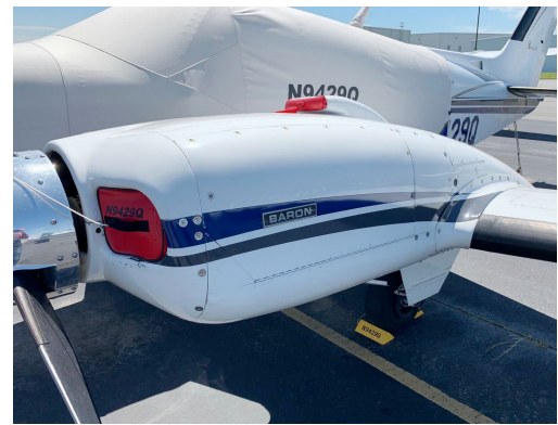
Beech Baron 58 Engine Plugs