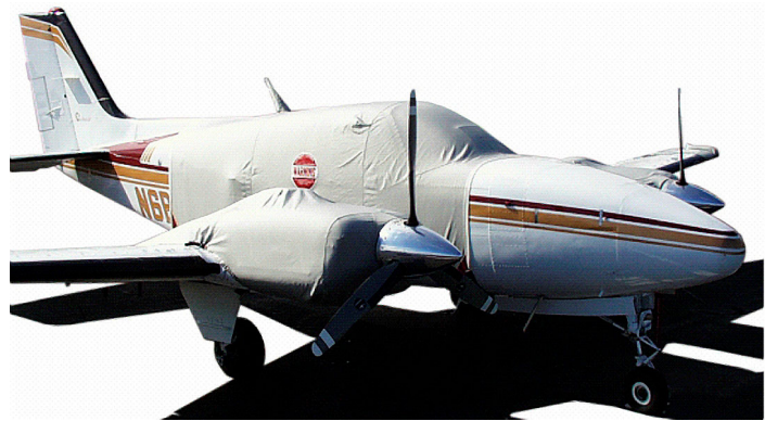
Beech Baron B55 Insulated Engine Covers Standard Canopy Cover & Engine Plugs. Extended Canopy Cover & Engine Cover