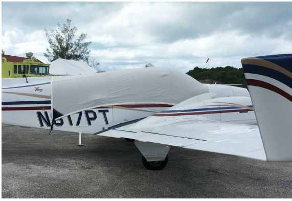
Beech Baron 58 Canopy Cover