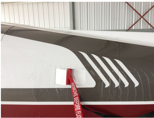
Beech Bonanza/Baron Fresh Air Intake & Exhaust Plugs