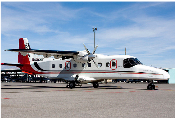
Covers, Plugs & HeatShields for the Dornier 228