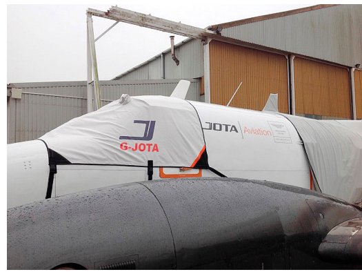
King Air Windshield/Cockpit Cover