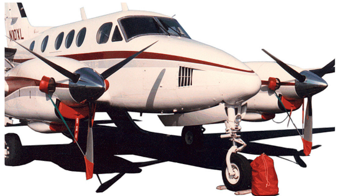
Pitot, Exhaust Covers, Engine Plugs & Prop Ties