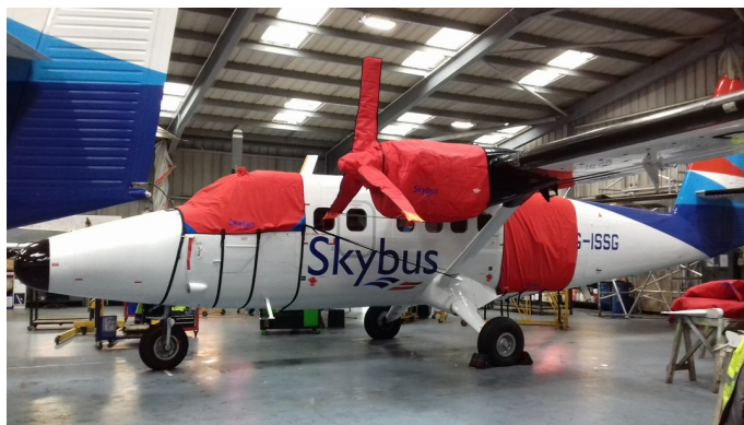
DeHavilland Twin Otter DHC6 (UV-18A) Cockpit Cover (CUSTOM COLOR)