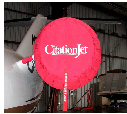
Cessna Citation Engine Cover Set