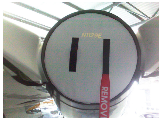
Citation XLS Exhaust Plugs