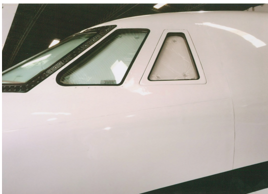
Citation XL Cockpit HeatShields

Cockpit Heatshields are interior sunshades for the aircraft's cockpit. The product is a unique composite of closed-cell foam with a silver mylar finish. The semi-rigid design is stiff enough to stand inside the window framing. The set folds up flat and is easily stored in the included storage sleeve. Some designs may require velcro and suction cups. Our Heatshields for jets are offered white side out because some aircraft manufacturers have issued advisories against reflective window inserts due to potential heat damage. A Heatshield is an excellent short-term remedy for cockpit overheating, but an external fabric cover is more effective for long-term protection.