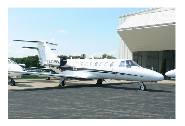
Cessna Citation CJ3 Bikini Style Engine Covers