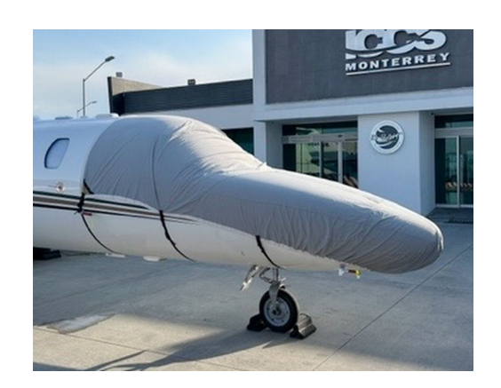
Cessna Citationjet 525B Travel Weight Cockpit/Nose Cover