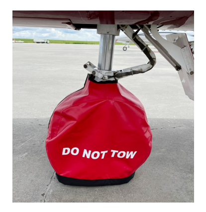
Citationjet CJ-3 Nose Gear Tire Cover