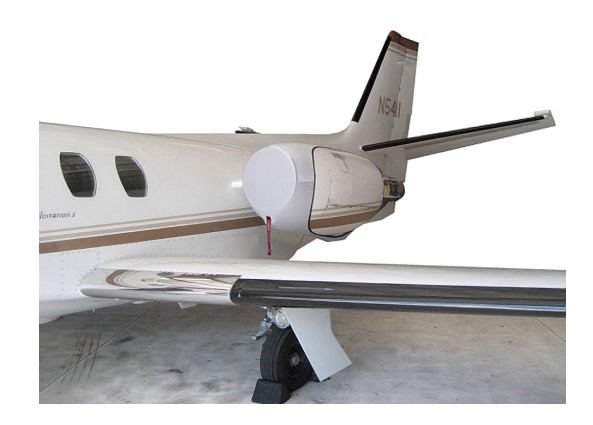
Cessna Citation "Bikini" Type Engine Covers: Extremely Light & Portable