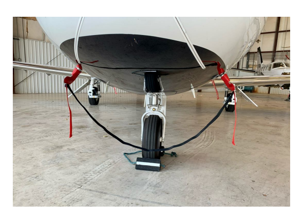
Cessna Citationjet CJ1 Pitot Cover Set