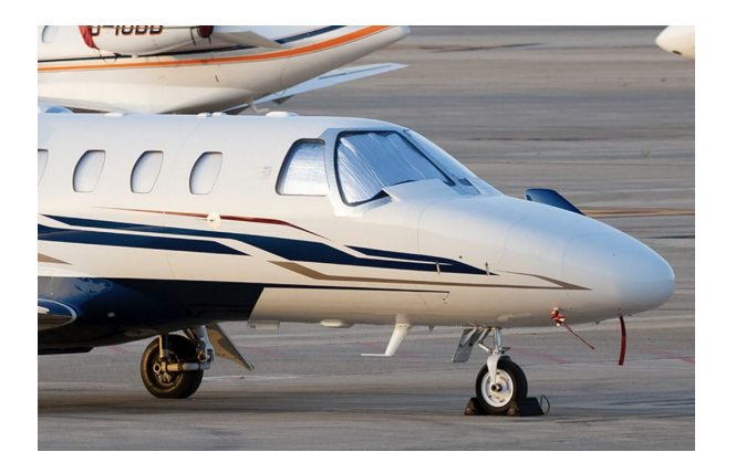
Cessna Citationjet 525, CJ-I, CJ1+, & M2 Cockpit Heatshields