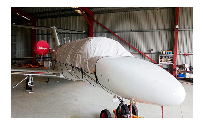
Citation CJ-1 Canopy Cover and Engine Covers

This cover type is made from Silver Acrylic Sunbrella canvas and is 100% lined with a soft and smooth microfiber. Bruce's Custom Covers developed this material combination especially for aircraft protection. The outer material is medium weight and treated for water resistance, UV resistance and anti-static buildup. The inner lining is a very soft and smooth microfiber to prevent scratching. The material is very reflective, and tests show that the cabin interior temperature can be reduced to near-ambient temperature on the hottest of days. It is water, ice and snow repellent, yet breathable to allow moisture to escape from between the cover and the aircraft surface.