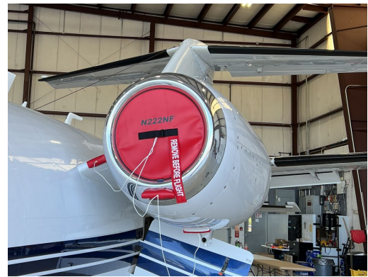
Cessna Citationjet 525A Intake Plugs Set