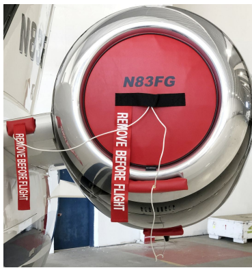
Cessna Citation Mustang 510 Engine Plugs