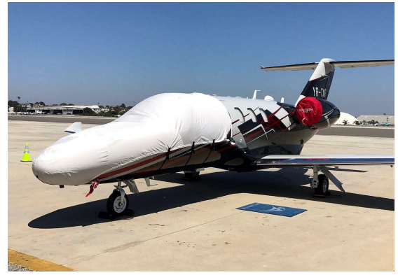
Citationjet CJ1 Cockpit/Nose Cover