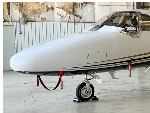
Cessna Citationjet CJ1 Pitot Cover Set