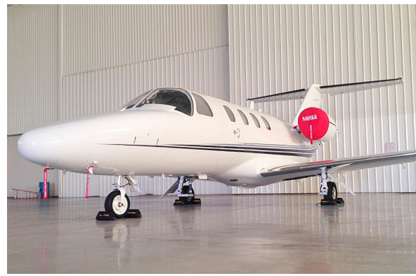
Cessna CJ1 Intake Cover