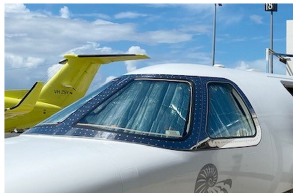
Cessna Citationjet CJ2 Cockpit HeatShields