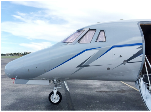
Cessna Citation 650 Cockpit HeataShields