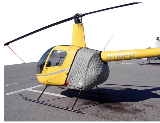
Robinson R-22 Insulated Engine Cover (also covers bottom) & Front Blade Tie-down