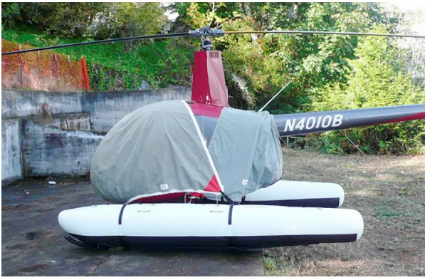
Robinson R-22 Standard Bubble Cover & Engine Cover