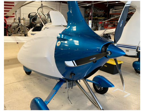
Autogyro Calidus Canopy/Nose Cover, test fit cover