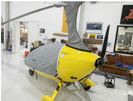
Autogyro Calidus Gyrocopter Canopy/Nose & Rotor Hub/Mast Cover

Rotor Hub Covers overlaps with the Blade Covers to ensure complete protection for the entire main rotor system. Designed like a jacket with sleeves and no collar, the rotor hub cover fastens together below each blade with Delrin buckles. The Rotor Hub Cover is normally made from Solution-Dyed Polyester.